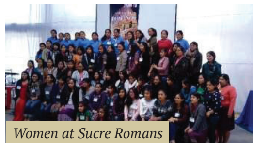
Women at Sucre Romans Workshop