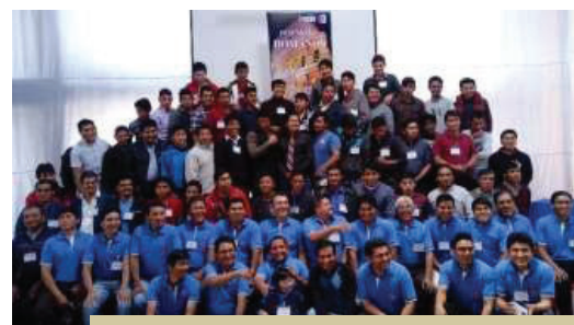
Men at Sucre Romans Workshop

Many blessings to all my brothers and sisters in Christ who support DM2 through prayer and finances. May God prosper your lives and those of your family and friends! From the heart of South America Bolivia.