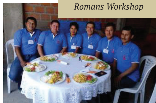
Teachers at Sucre Romans Workshop

It was quite a blessing because we got to share the book of Romans with all these believers who had always been taught they could lose their salvation. It was very impacting to clear up their bad understanding on the issue of eternal security. They had never learned these truths and their hearts overflowed.